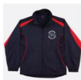
MBNS Youth Jacket