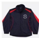
MBNS Adults Unisex Jacket

https://www.printcity.net.au/product-category/murray-bridge-north-school/https://bit.ly/3dwuMQo https://bit.ly/3dwuMQo